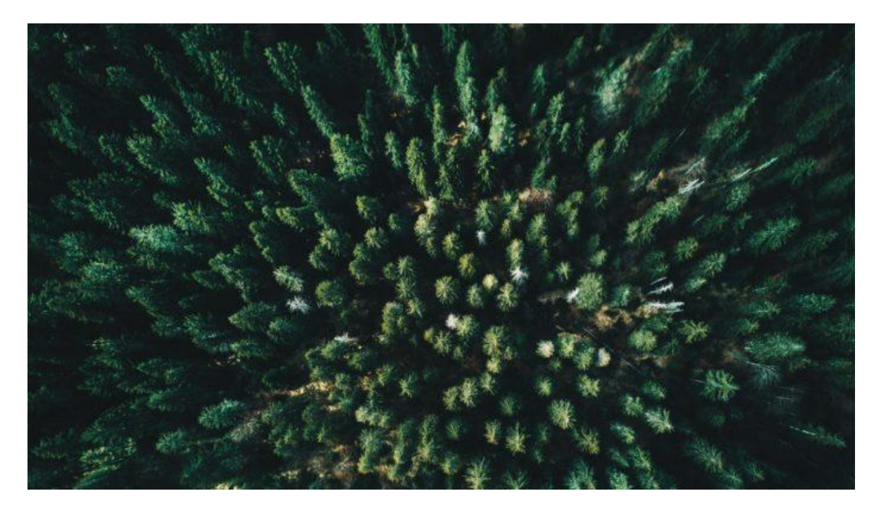
In Switzerland, the national inventory has been updated only every ten years or so.

An EPFL doctoral student has come up with methods to map out forests more effectively using aerial remote sensing, in support of on-the-ground forest inventories.